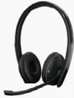
ADAPT 260 Bluetooth stereo headset with dongle