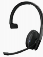
ADAPT 230 Bluetooth mono headset with dongle